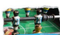
FUSBAL AND AIR HOCKEY