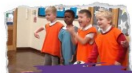
GROUP GAMES AND SPORTS