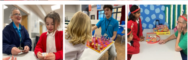
AFTER SCHOOL CLUB AT OLDFIELD PRIMARY SCHOOL

Last few spaces available on MONDAY TUESDAY FRIDAY