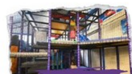
BIG ON BOUNCE