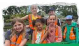
PARK TRIPS AND DEN BUILDING