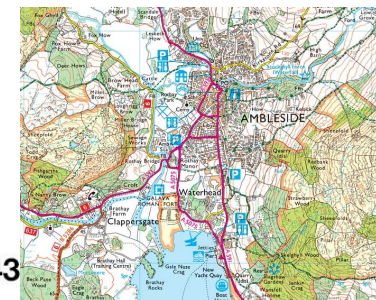
The grid reference for the arrow is 1943