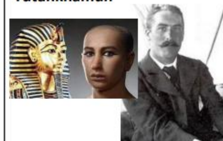
Egyptologist: Howard Carter